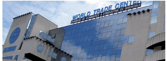
World Trade Centre Grenoble – 5 / 7 place Robert Schumann – 38000 Grenoble – France. Tel : +33 4.76.28 28 44