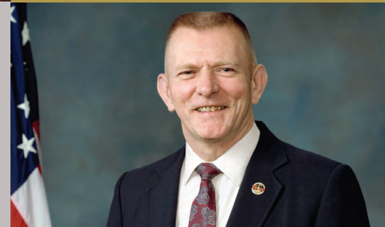
Legendary NASA Flight Director at SimTech2016

Bigger and better than ever, the 2016 Simulation Technology (SimTech) Conference will be held in New Orleans, Louisiana from September 11-16 at the beautiful Loews Hotel conveniently located near the French Quarter. We are pleased to announce that SimTech 2016 will parallel tracks for Power and Rail professionals. Stay tuned as we post final agendas!